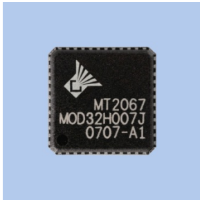
MT2067 Single-Chip Automotive Tuner

The MT2067 is an advanced 3.3V single-chip automotive broadband tuner for analog and digital terrestrial standards worldwide