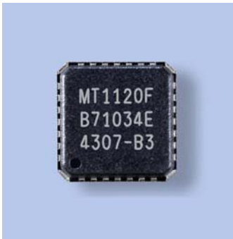
MT1120 High Performance Automotive AM/FM Amplifier Subsystem

The MT1120 is a highly integrated and complete RF amplifier subsystem for active AM/FM antennas